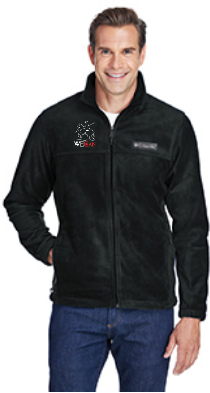
3220 Mens Columbia Fleece Jacket Black or Charcoal Grey Sizes S, M, L XL, 2XL, 3XL Quantity 1-5 $75.00 each