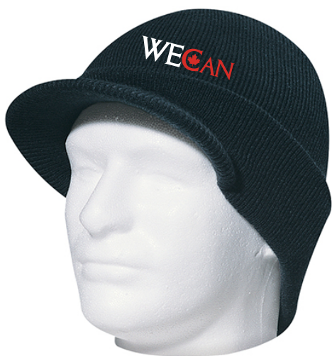
0490M Acrylic Jeep Toque Black or Navy Blue One Size Pliable Peak Quantity 1+ $20.00 each