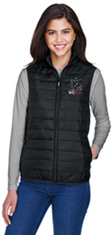
CE702W Womens Puffer Vest Black or Carbon Grey Sizes S, M, L XL, 2XL, 3XL Quantity 1-5 $75.00 each