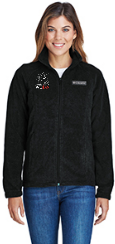
6439 Womens Columbia Fleece Jacket Black or Charcoal Grey Sizes XS, S, M, L XL, 1XL Quantity 1-5 $75.00 each Quantity 6+ $65.00 each