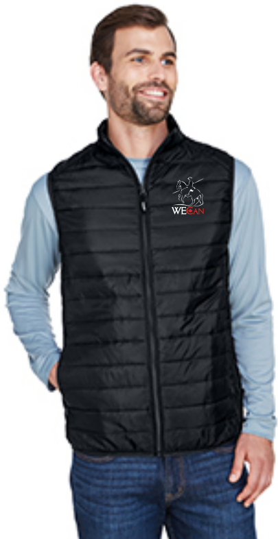
CE702 Mens Puffer Vest Black or Carbon Grey Sizes S, M, L XL, 2XL, 3XL, 4XL Quantity 1+ $75.00 each