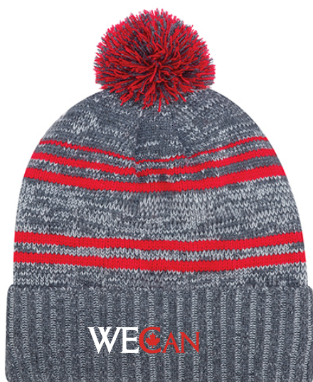
9G087M Cuff Toque (Pom Pom) Charcoal/Red or Black/White One Size micro fleece lining Quantity 1+ $20.00 each