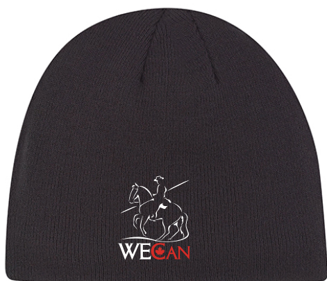
1J030M Board Toque Black or Charcoal One Size micro fleece lining Quantity 1+ $15.00 each